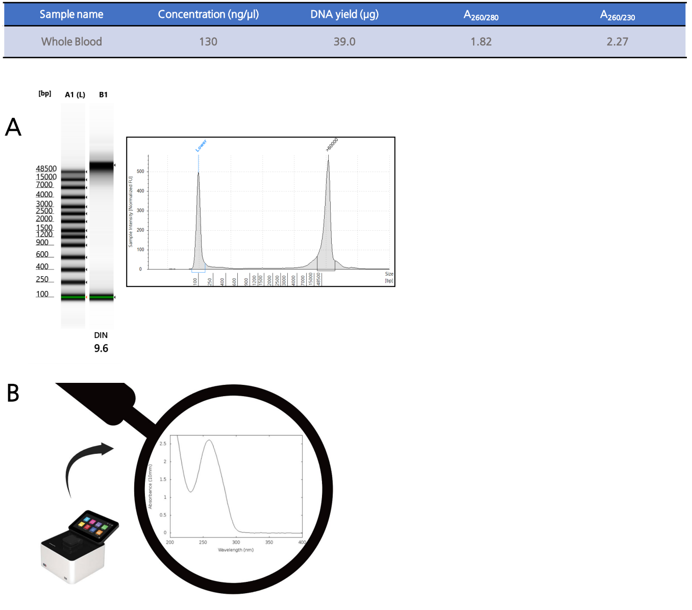
Table 1. Spectrophotometric measurements of UHMW DNA extracted from human whole blood.

Figure 1. (A) Agilent 4150 TapeStation analysis (B) Spectrophotometrical analysis